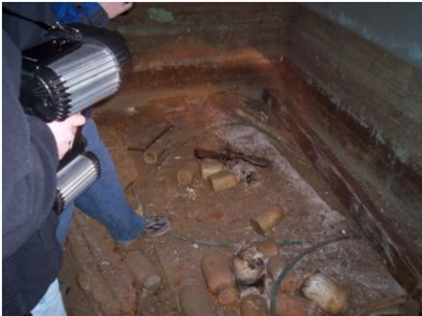
Entrapment area...some old jars filled with milk perhaps?? you can see a bird on the floor w/it's wings spread.