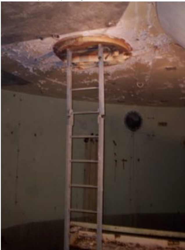
This is the ladder to the escape hatch on the top floor of the command center. It was really clean up there and a large section of the floor between the upper and lower floors had been removed. We could not figure out why.