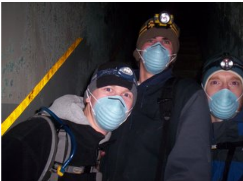
Some of us in the stair well entry way...