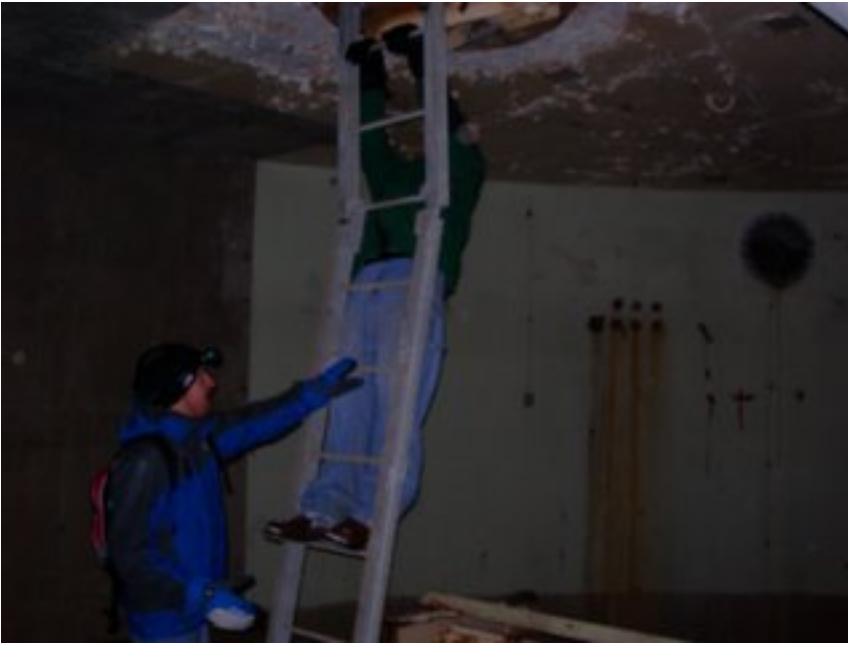
Climbing ladder to escape hatch