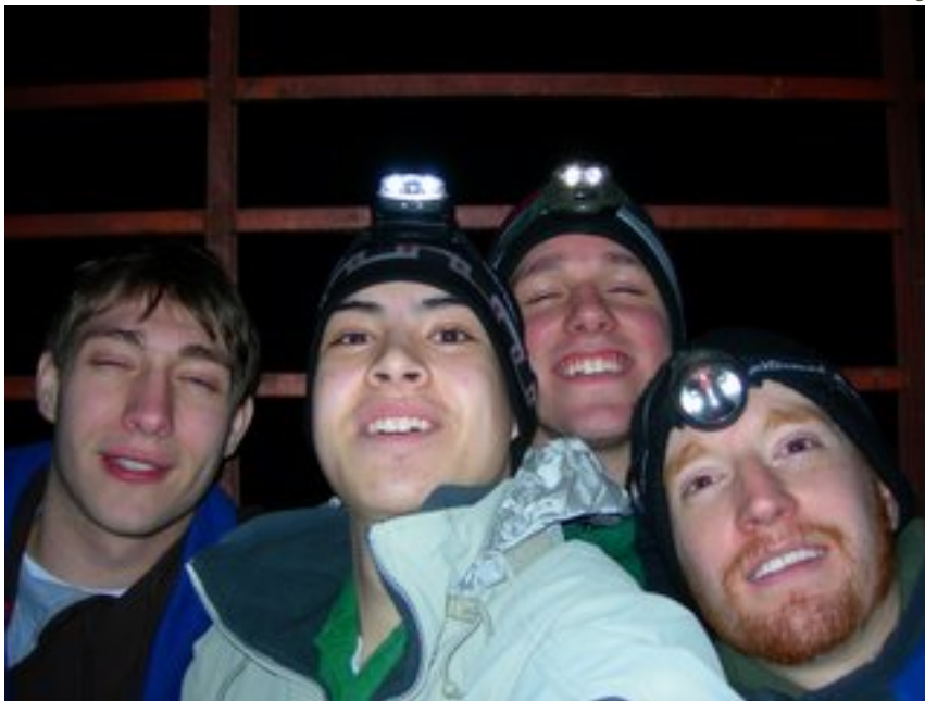
That's a bunch of fellas